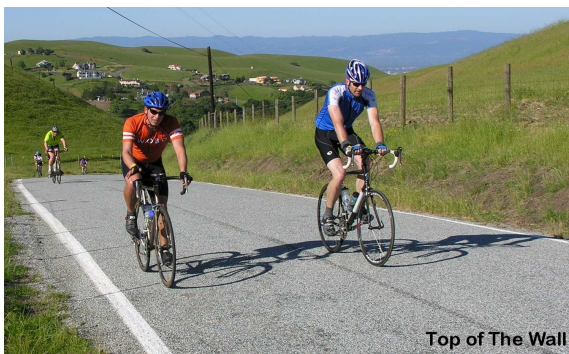
Top of The Wall